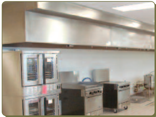
Typical Ventilator Installation - Macalester College - St. Paul, MN